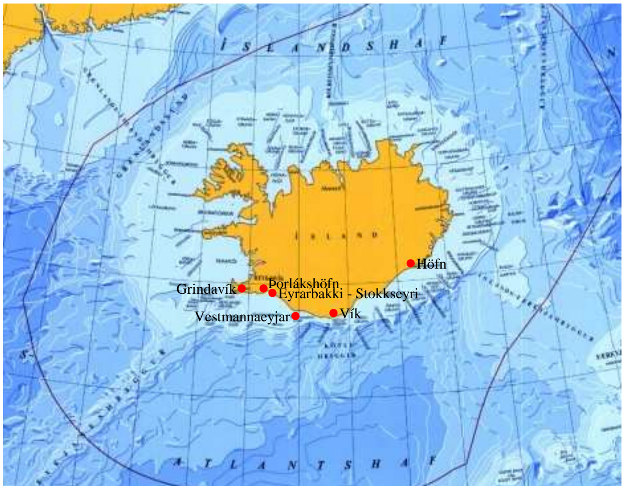
Fig. 2 Iceland and surrounding seas, depth scale by deeper blue for each 200 m. Population centres in red.